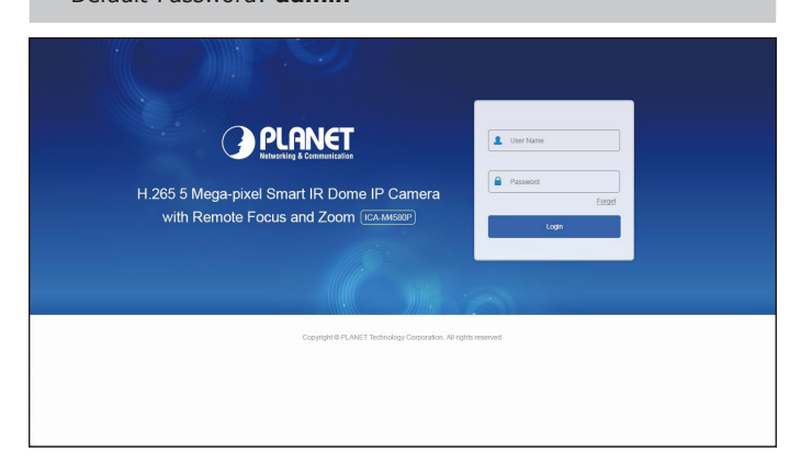
Figure 4-3: ICA-x80 series Web Login Screen

Default Username: admin Default Password: admin