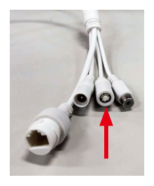
Figure 5-1: Reset Button